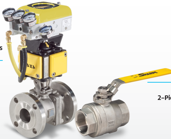
2-Piece CWP Ball Valves

ASC Engineered Solutions™ is proud to offer Sharpe brand automated and manual valves from general purpose to the most demanding applications.